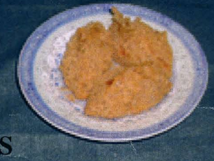
#23 HARNNG SUI KWOK SPICED CHICKEN & SWEET RICE