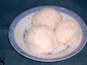
#48 COCCONUT PUDDING