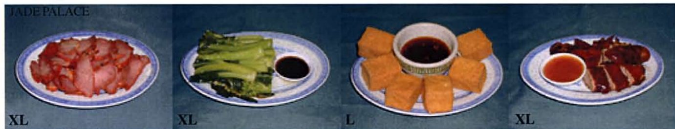
#301 CHINESE ROAST PORK