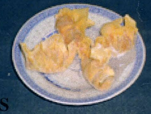
#50 WOO TOU KOU TARO CAKE