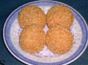
#T11 STEAMED OR FRIED BUN