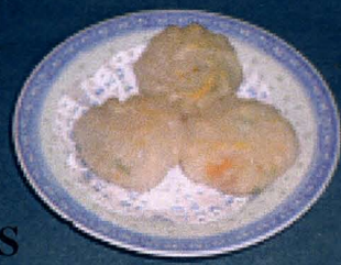
#18 NGAU YUK KAU BEEF MEET BALL