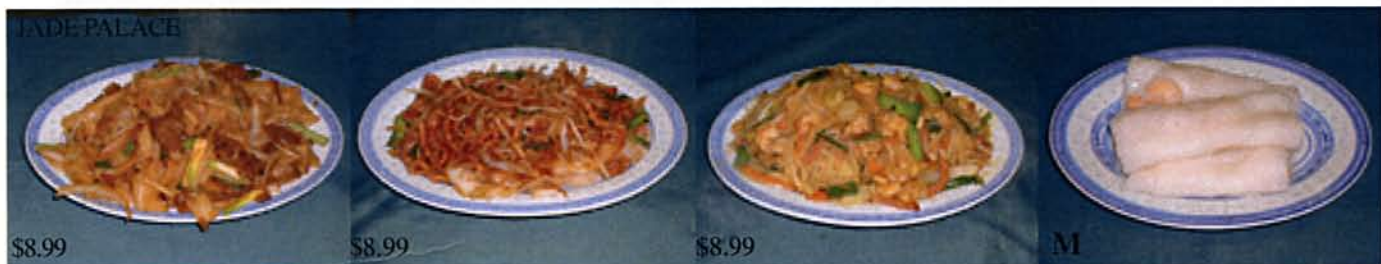
#32 STIR FRIED RICE NOODLE WITH BEEF