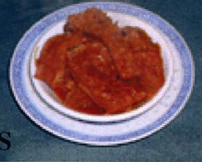
#44 SEEN CHUCK KN PORK AND SHRIMP WRAPPED IN TOFU SKIN